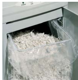
Front door for easy emptying of collecting bag