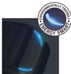
"ENERGY SMART" Management system for zero power consumption in Stand-by mode