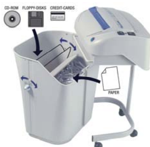
Removable waste bin with a special mechanism to separate shredded paper from plastic shreds of credit cards, CD-Rom and Floppy-Disks